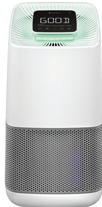
Active HEPA+ Room