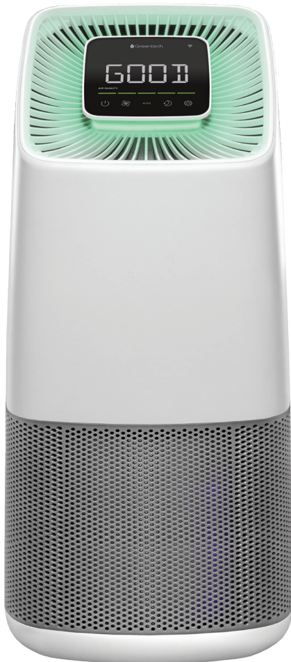
Active HEPA+ Pro